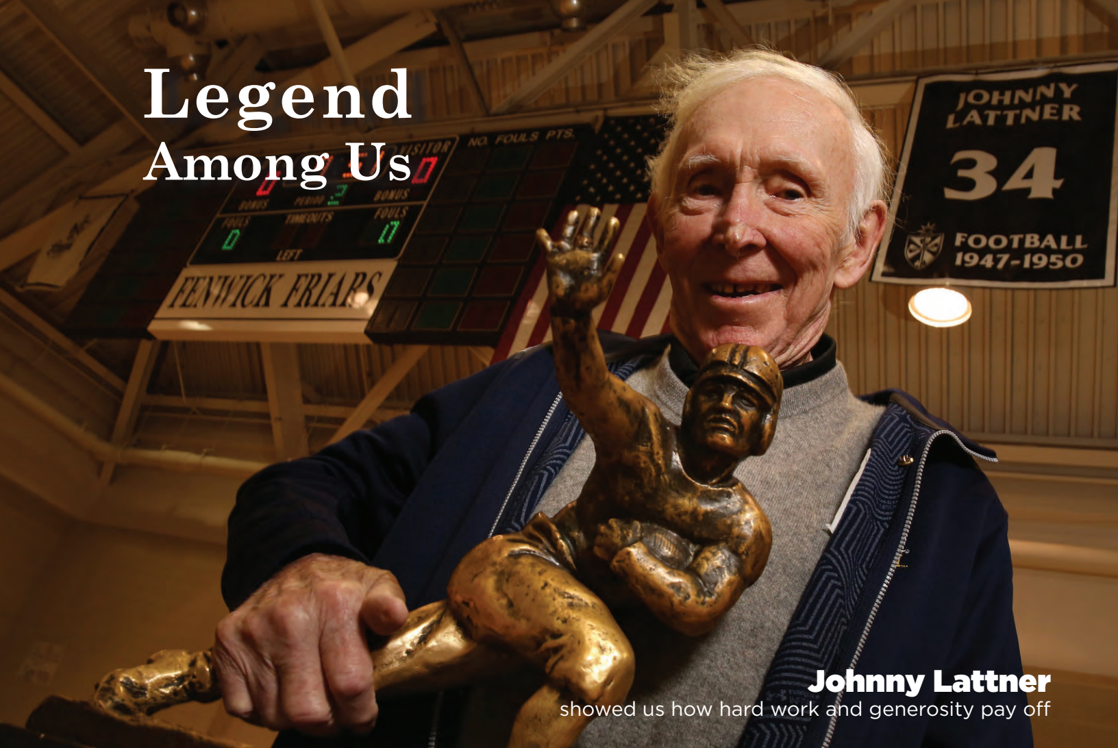
Johnny Lattner showed us how hard work and generosity pay off