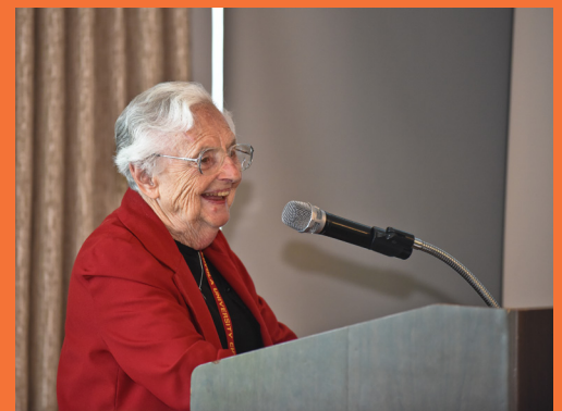
Photo: Sister Jean Dolores Schmidt, BMV speaks at the Community GEMs Luncheon.

The guest speaker for the kick-off was 97-year old Sister Jean Dolores Schmidt, chaplain of the Loyola University Chicago's Ramblers, the men's basketball team. She engaged attendees with her inspirational speech about how she has aged well.