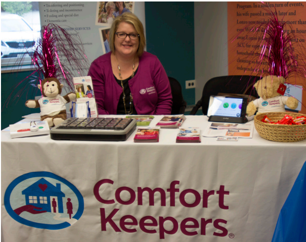
Photo: Comfort Keepers, a Community Resource Network partner, participates in a resource fair at Aging Care Connections as part of the La Grange Business Association's Girlfriends Getaway in May.

Partners in the journey to age well in the community